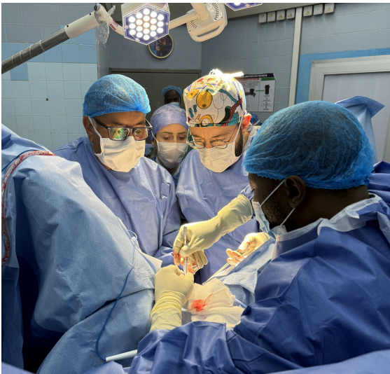
MMS surgeons working alongside Togolese colleagues at the Sylvanus Olympio Hospital.

In 2025, 30 women received fistula repair surgery . All patients from previous missions were seen for a follow-up, and many new patients were examined, either to prepare them for a future mission or to offer treatment with medication.