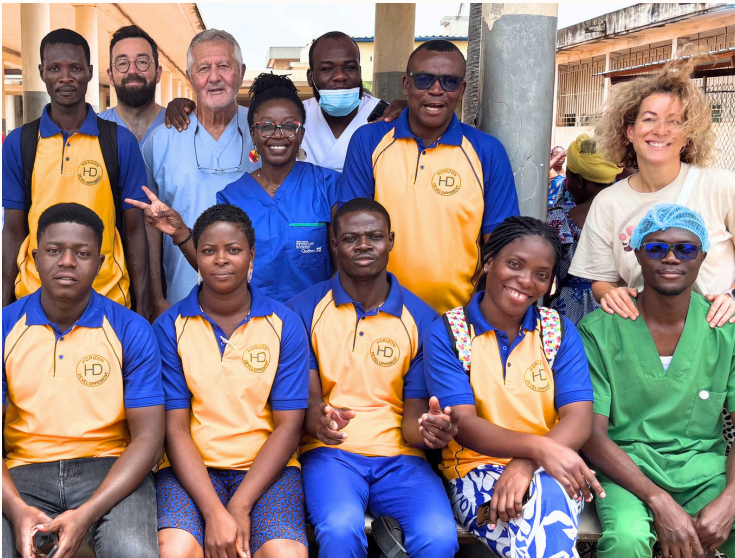
MMS team with the staff of Horizon Développement.

We have continued our partnership with Horizon Développement , a local NGO that recruits patients, provides education on fistula prevention, and manages all the local coordination before, during, and after our surgical missions.