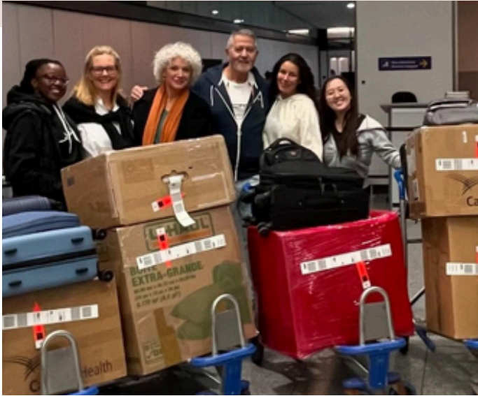
MMS team leaving from Montréal airport, transporting medical equipment generously donated by our partners.

We extend our sincere thanks to all donors whose generosity makes our work possible. We are especially grateful to the companies providing essential surgical equipment, and in particular to Cardinal Health and Storz Canada , for their continued support.